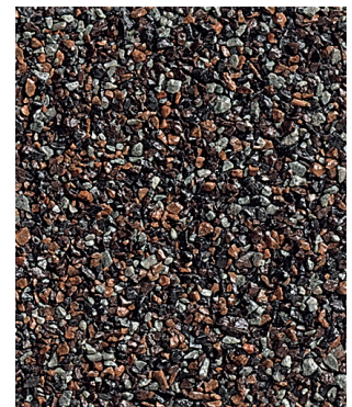
DECRA TILE Weathered Timber