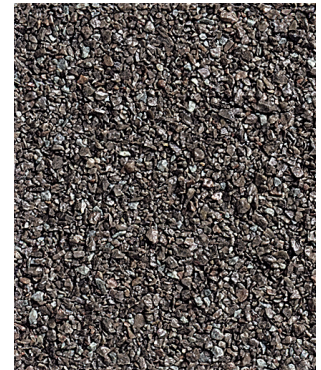
DECRA TILE Granite Grey