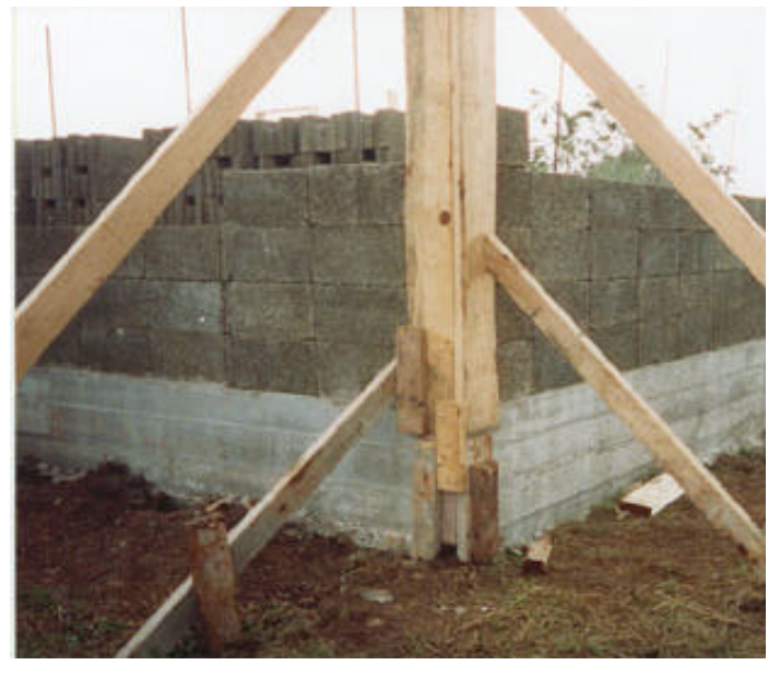
Lintel Made with FASWALL