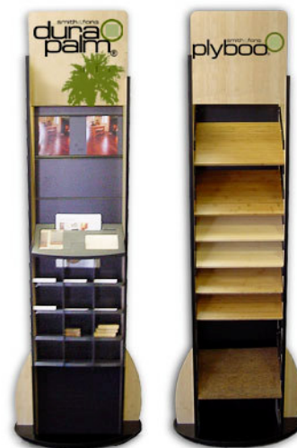
Product Display - Front and Back for smith & fong - plyboo and durapalm